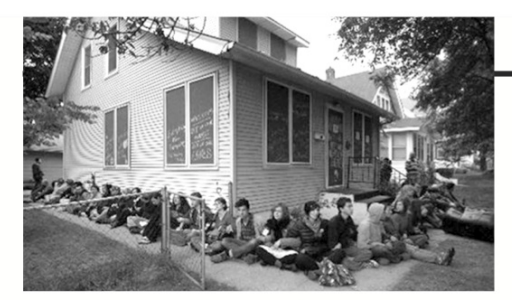
Eviction defence, Occupy Minneapolis, 2012

DEBT IS THE TIE THAT BINDS THE 99%. We must transform our failed economic system that impoverishes millions while destroying the ecosystem. Using a diversity of tactics that includes a Rolling Jubilee, a People's Bailout, and vigorous organizing towards a debt strike, Strike Debt seeks to abolish debt as it currently exists and reconstruct a just society where our debts and bonds are to one another and not the 1%. The 99% are forced into debt to pay for basic social needs like education, housing, and healthcare while the 1% profits. We can no longer afford our own oppression. We are citizens, homeowners, renters, teachers, students, parents, children, debtors, and defaulters who don't owe the banks anything. We owe each other everything.